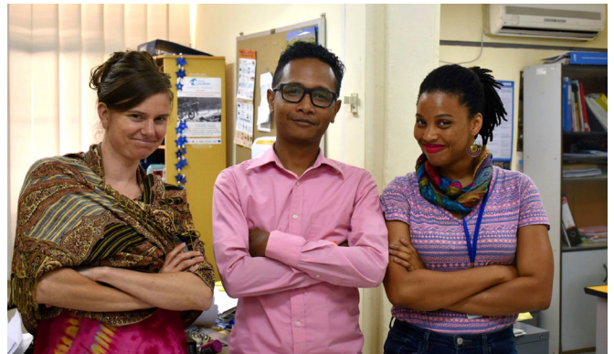
Members of the UNWomen office dressed in pink to show solidarity for Timor-Leste's first pride festival.