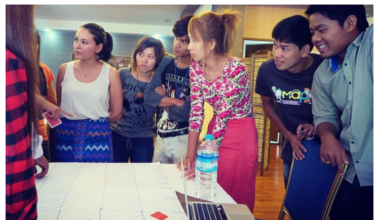
. Conflict timelines exercise.