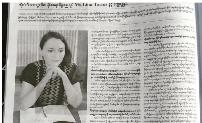
Featured in the Yangon Times.

This experience not only allowed me to support Internews Myanmar, but also was very important for my personal development, as I was able to test myself on an international project for the first time. I benefited tremendously from the cultural exchange, and from connecting with a strong network of people working in peacebuilding in Southeast Asia.