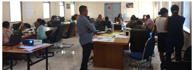
A major consultation that was held with the NGO partners as well as the Timorese government on the NAP-WPS.